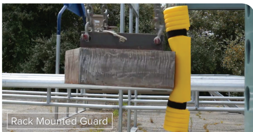
Rack Mounted Guard

Rack Mounted Guard Kit Materials: Polyethylene body, hook & loop straps